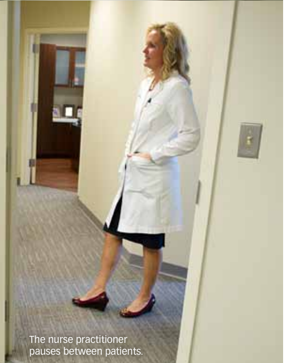
The nurse practitioner pauses between patients.