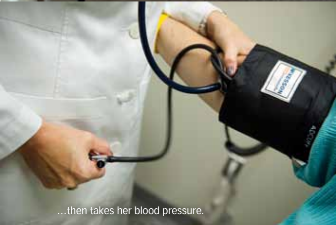
...then takes her blood pressure.